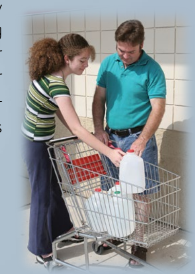
Pure & healthy